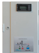
BUDGET CONTROL CARD