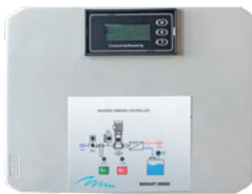
BUDGET CONTROL CARD